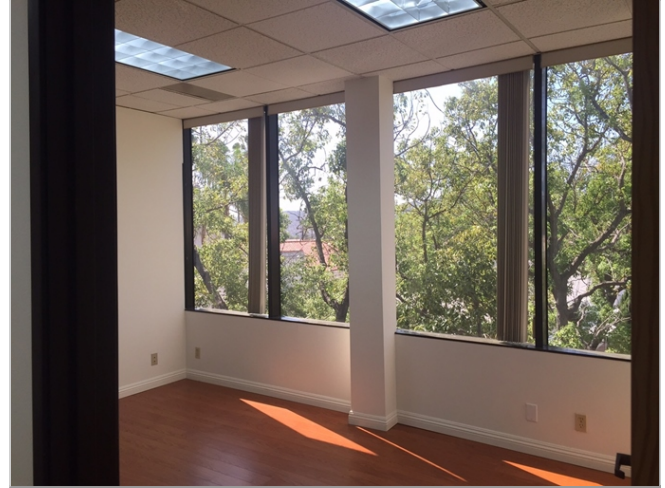
220 S. Kenwood St.