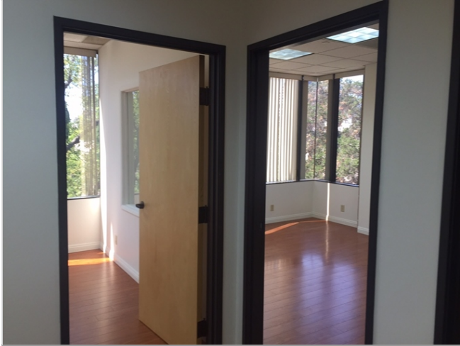
220 S. Kenwood St.