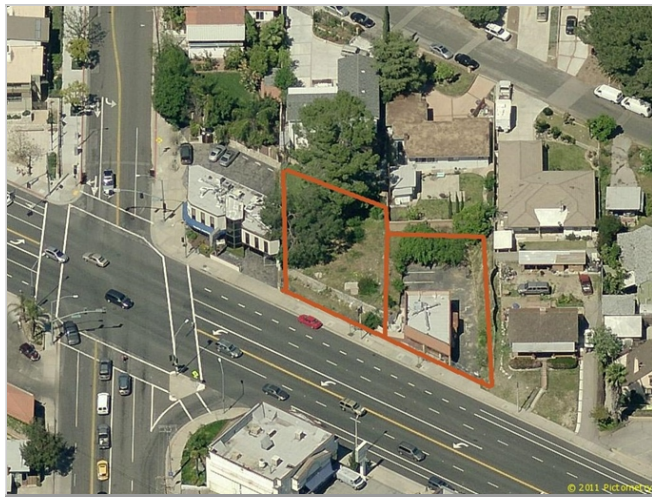
2767-73 Foothill Blvd